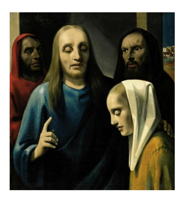
Fig.2: Han Van Meegeren, Christ and the Adulteress , 1942, oil on canvas, 39.4 x 35.4 in., from the collection of the Fundatie Museum, via the Netherlands Cultural Heritage Agency, Zwolle, Netherlands.

Despite the presence of masterpieces of Rembrandt and Grünewald, A. Feulner wrote in the "Magazine for the History of Art" that it was "the spiritual centre" of the whole exhibition.