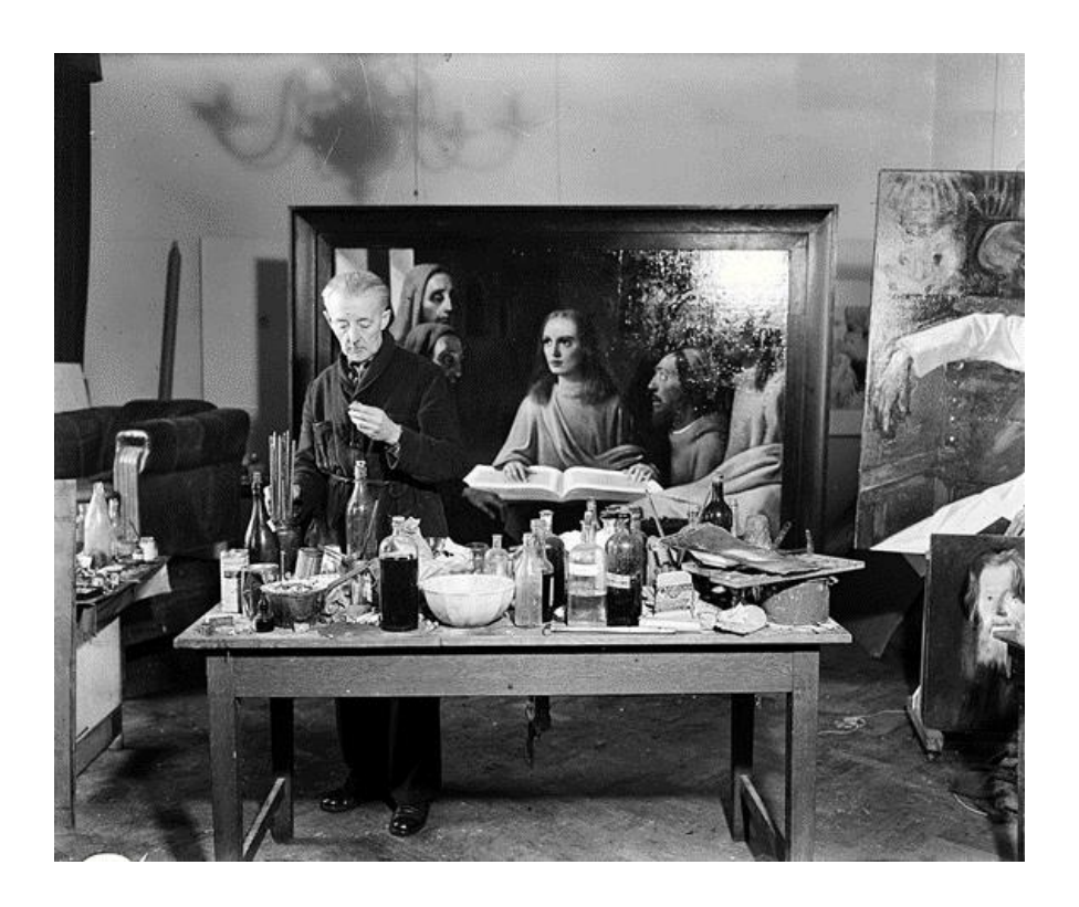
Han van Meegeren painting Jesus Among the Doctors in 1945

paints to harden after application, making the paintings appear as if they were 300 years old. Van Meegeren would first mix his paints with lilac oil, to stop the colours from fading or yellowing in heat. This caused his studio to smell so strongly of lilacs that he kept a vase of fresh lilacs nearby so that visitors wouldn't be suspicious. Then, after completing a painting, he would bake it at 100 °C (212 °F) to 120 °C (248 °F) to harden the paint, and then roll it over a cylinder to increase the cracks. Later, he would wash the painting in black India ink to fill in the cracks.