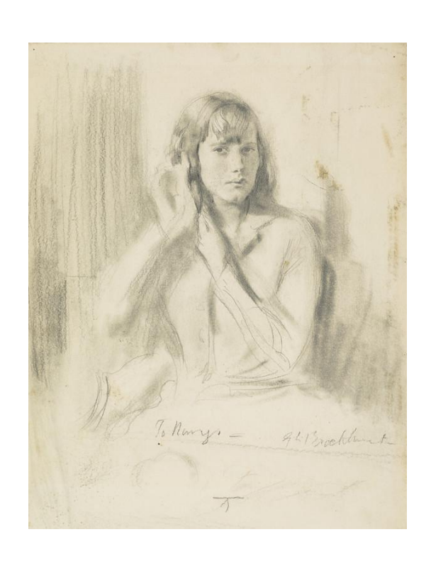
Nancy Woodward, pencil on paper, 38.7 x 27.8, Scottish National Gallery of Modern Art.