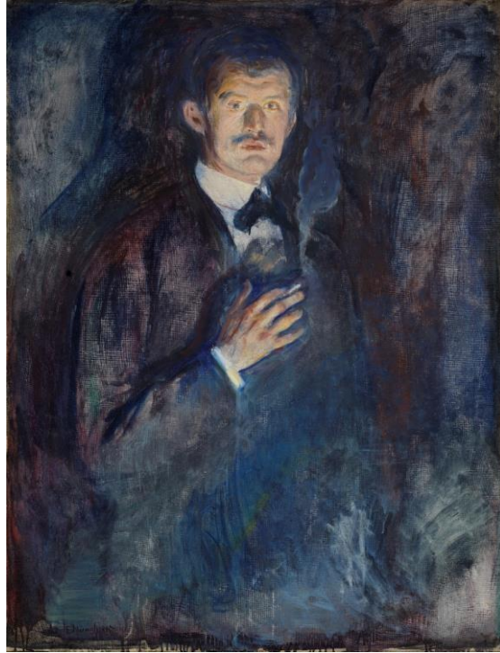
Fig. 1. Edvard Munch, Self-Portrait with Cigarette , 1895, oil on canvas, National Gallery, Oslo.

THOS. AGNEW & SONS LTD. 6 ST. JAMES'S PLACE, LONDON, SW1A 1NP Tel: +44 (0)20 7491 9219. www.agnewsgallery.com