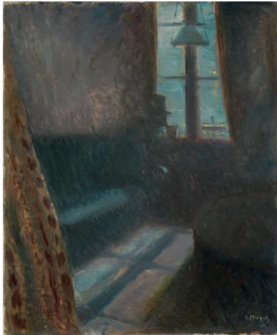
Fig. 2. Edvard Munch, Night in Saint-Cloud , 1890, oil on canvas, National Museum, Oslo.