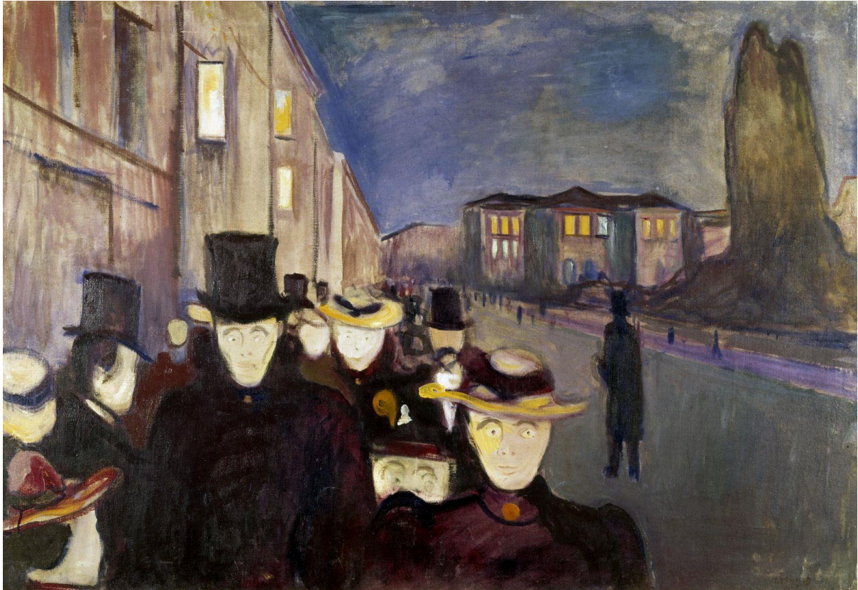
Fig. 4: Edward Munch, Evening on Karl Johan , 1892, oil on canvas, KODE Bergen Art Museum.

THOS. AGNEW & SONS LTD. 6 ST. JAMES'S PLACE, LONDON, SW1A 1NP Tel: +44 (0)20 7491 9219. www.agnewsgallery.com