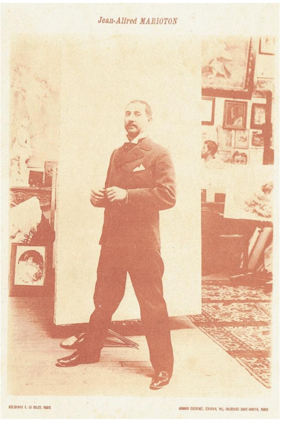
Fig. 2: A photograph of Jean-Alfred Marioton, from 'Dessins, croquis, études de figures des peintures décoratives de Jean-Alfred Marioton', published by his brother Claudius Marioton - Bookstore of Decorative Art Armand Guérinet, 140 faubourg Saint-Martin in Paris - Reproduction by heliotype at E. Le Delay in Paris - undated, probably from 1905.