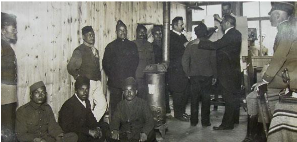
Fig. 3: Voice recordings carried out by Wilhelm Doegen in the Half Moon Camp, c.1916

Thos Agnew & Sons Ltd, registered in England No 00267436 at 21 Bunhill Row, London EC1Y 8LP VAT Registration No 911 4479 34