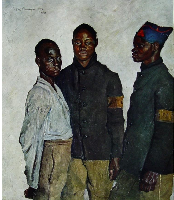
Fig. 5: Thomas Baumgartner, Portrait of three Bobo soldiers , location unknown.