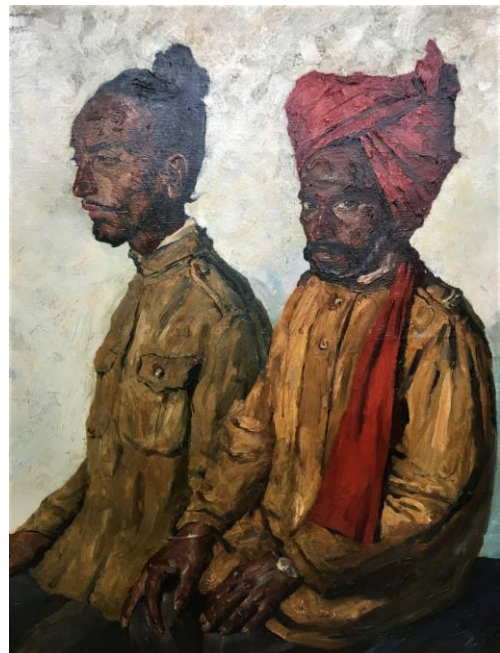
Fig. 7: Thomas Baumgartner, Portrait of two Sikh soldiers (Punjabi people) , 1917, Agnew's Gallery.