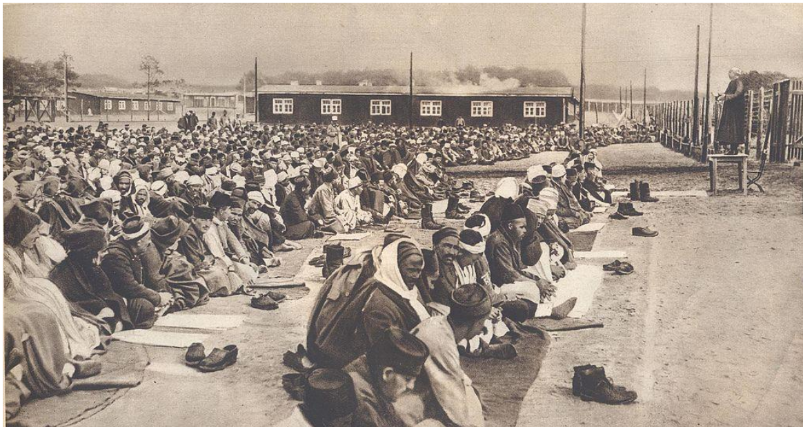
Fig. 1: Half Moon camp at Wünsdorf near Berlin, Germany, c. 1916.