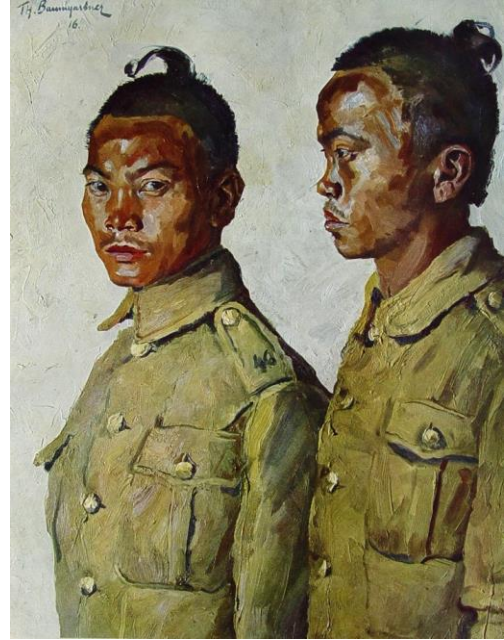
Fig. 9: Thomas Baumgartner, Portrait of two Gurkha soldiers , location unknown.