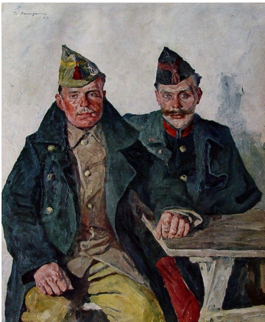
Fig. 10: Thomas Baumgartner, Portrait of two Belgian soldiers , location unknown.