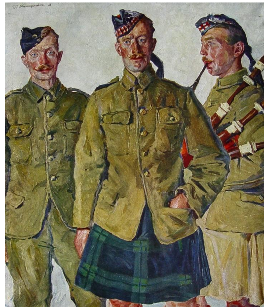
Fig. 11: Thomas Baumgartner, Portrait of three Scottish soldiers , location unknown.