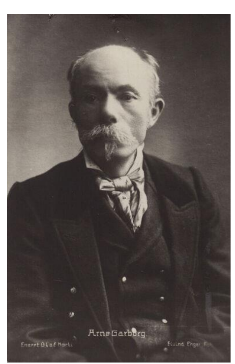
Fig. 4: Portrait of Arne Garborg, 19th century.

Fig. 3: Gustav Vigeland (1869 - 1943), Henrik Ibsen, 1903, plaster, Vigelandmuseum, Oslo.