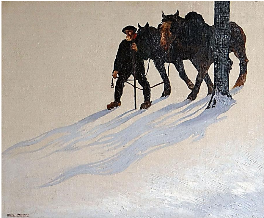
Fig. 3: Maurice Langaskens, Christmas Tale , Oil on canvas