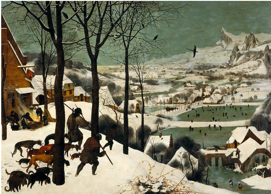
Fig. 1: Pieter Bruegel the Elder, Hunters in the Snow , 1565, Kunsthistorisches Museum, Vienna

founding member of the group L'Art Monumental and worked in the same circles as some of the great Belgian artists of the 20 th century, such as Jean Delville, Constant Montald, Albert Ciamberlani and Emile Fabry.